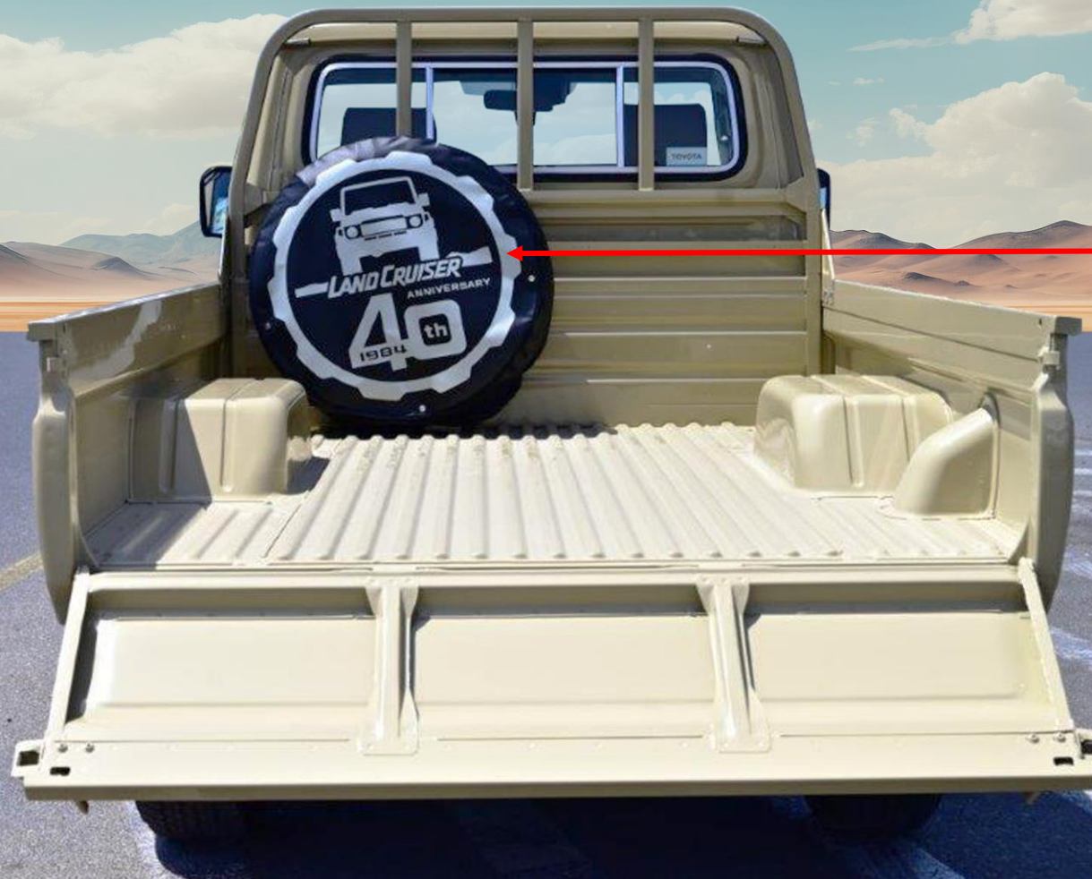
SPARE WHEEL WITH COVER